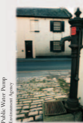
Public Water Pump