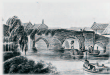
The Old Great Bow Bridge

Follow the bend around the river and walk over the bridge. You will see Langport's Great Bow Bridge, built in 1840 after the original nine arched bridge was demolished.