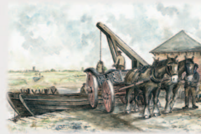
Unloading the barges Edward Page Tomkinson

2 As you cross the road, you will notice Great Bow Yard. This would have been a noisy and busy place in the 1800s. Flat bottomed barges came up on the tide from Bridgwater and carried all manner of goods. Pre - 1840 the goods were unloaded and carried under the small arches of the bridge to smaller barges.