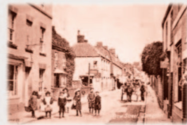
Bow Street in the past

You may notice that the houses are leaning drunkenly backwards along the length of Bow Street. In 1616 Bow Street was described as being supported by 31 arches known as bows to form an ancient causeway. The fronts of the houses rest on that causeway whilst the backs of the houses were built onto the moors without solid foundations, causing the lean.